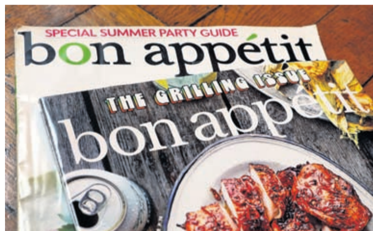
Two covers of Bon Appetit magazine are shown in this photo, in New York, Wednesday, June 10, 2020.